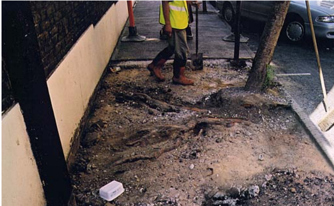
Tree roots can lift and damage pavements

telephone cables. Work associated with this maintenance often has an impact on street trees, which are placed under stress and strain as their underground and above ground parts are damaged. The refurbishment, demolition and reconstruction of buildings involves tremendous amounts of material movements, scaffolding, skips and delivery vehicles as well as excavations, all of which can lead to damage to trees. Reconstruction of footpaths and carriageways and excavations of underground services can all have an impact.