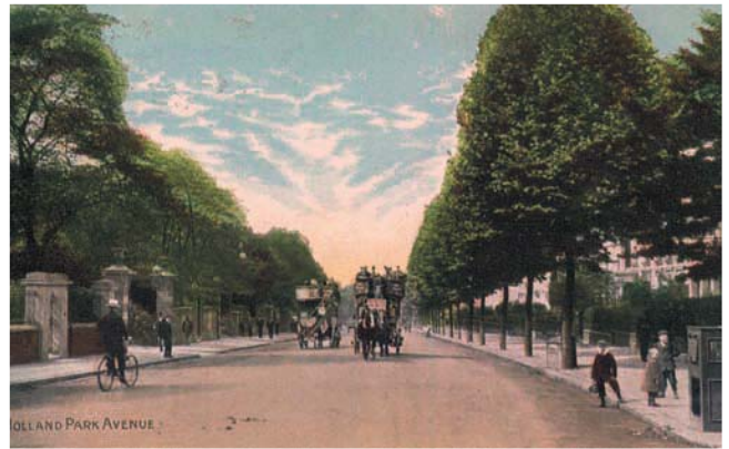
Holland Park Avenue PAST

The Council has a “duty of care” and employs trained and experienced Tree Officers to act as day-to-day managers as well as to provide technical advice on tree matters to Councillors and other sections and departments within the Council. This “duty of care” extends to maintaining trees in such a way that they do not interfere with pedestrian or vehicular traffic and, where building subsidence may be an issue, that appropriate action is taken to manage and minimise risks. It has been mentioned that trees are vulnerable to construction activity. When granting planning permission, the Council has powers under the Town and Country Planning Act, 1990 to protect trees “off site” that may be affected by the granting of a permission. Grampian Conditions or Section 106 Agreements can be used to protect street trees from development pressures or to agree schedules of work with developers to plant new street trees