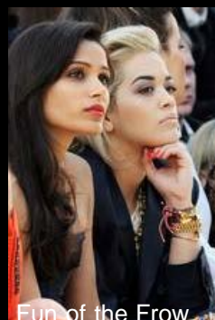
Fun of the Frow