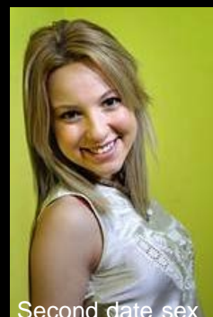
Second date sex