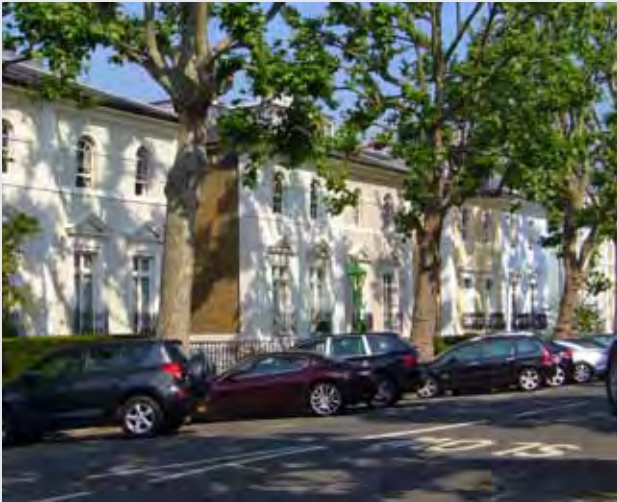
41-51 Addison Avenue

2.4.27 Addison Avenue, leading up to St. James's Gardens, is a wide boulevard, with a grand vista designed to terminate in the church with its originally intended spire. Addison Avenue's paired houses are treated as villas of elegance and carefully considered design. The 22 early 19th century houses in the northern half of the street (all Grade II listed) form two ranges of two storey houses with basements and rooms in the roofs, each pair being linked to its neighbours by the principal entrances, which are set back at the sides. The main doorways are large and trabeated with central piers and the first floor windows feature semi-circular headed sashes. The main roofs overhang substantial eaves. The stucco facades are divided by decorative pilasters and string courses. North of the crossing with Queensdale Road, the houses are spacious internally, and externally they feel spacious too with 30 metres between the frontages. With the lovely mature street trees they comprise an almost Arcadian setting.