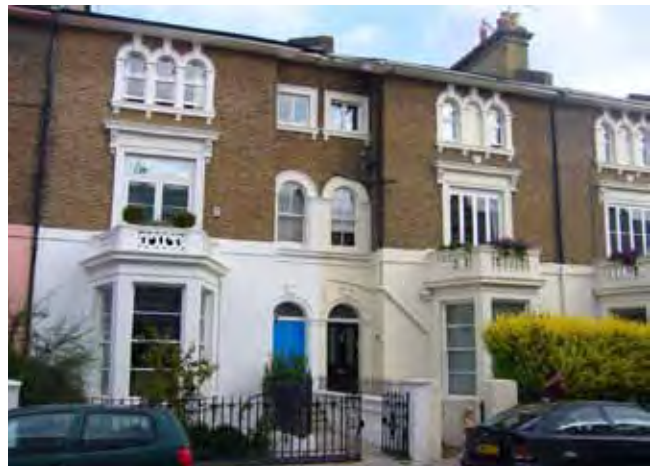
44-46 Portland Road