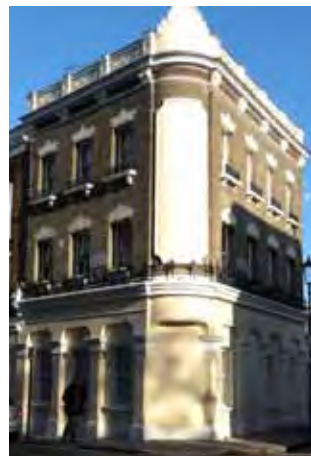
84 Princesdale Road