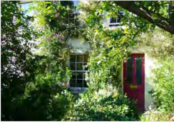
2.4.54 Addison Place , behind the south side of Queensdale Road, linking through to Addison Avenue, contains charming early 19th century Grade II listed cottages on the north side (14-22 even). On the south side is a row of post-war two-storey dwellings in a curving terrace of modest height.