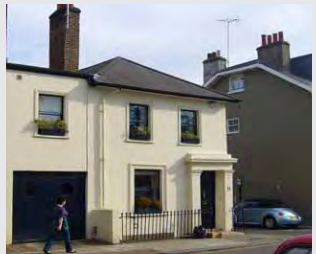
11 Queensdale Road

nice though most are now missing. The north side is of later date, and different architectural style. At the west end is the Sikh Temple.