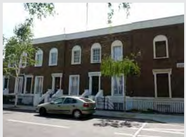
2.4.58 Wilsham Street comprises attractive two-storey artisan houses - a more-or-less integrated terrace which was spared the post-war redevelopment of the Edward Woods Estate. The houses towards the western end are two-storeys with basements, have architraves, more architectural detailing round the doors and windows (though the cornices are missing). Alterations to the elevations and the painting of 65-117 (odd) Wilsham Street are subject to Article 4 Directions.