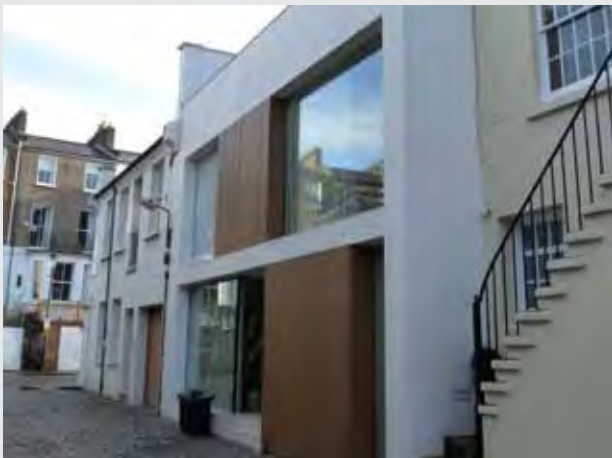
13 Norland Place

2.4.87 Since the Conservation Area Proposals Statement (1982), new buildings have only replaced dilapidated stock to a very limited extent. Previous new building has resulted in a few interesting buildings whose architectural style does not detract from the character of the area: Princes Yard, 1 Addison Place, 17b Princes Place (now 2-4 Carson Terrace) are such examples.