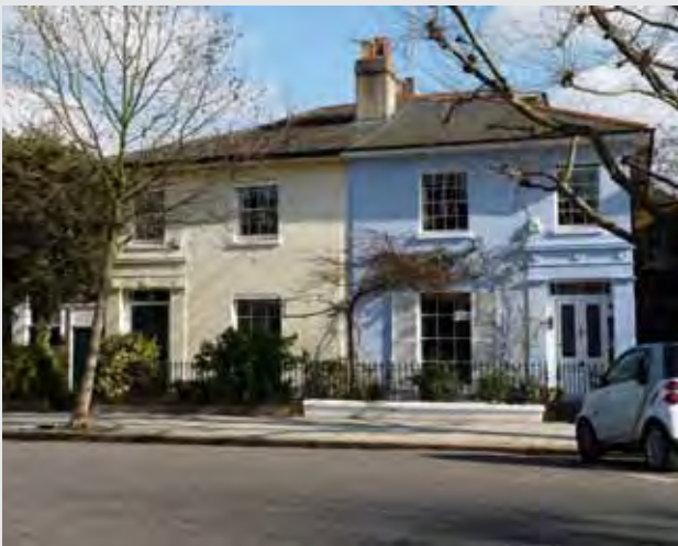
22-24 Addison Avenue

2.4.28 The setting is so splendid that one is