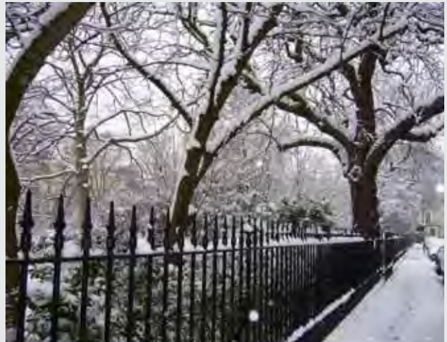
Norland Square railings