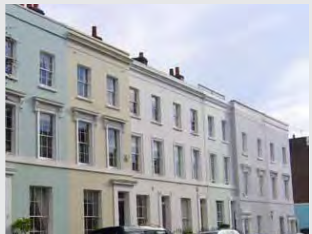
15-27 Queensdale Road

2.4.34 Dwellings on Queensdale Road are protected by Article 4 Directions. These directions protect the façades, prevent the rendering and painting of brickwork, and protect enclosures of other houses in the street. For further details which addresses are affected see Appendix 1.