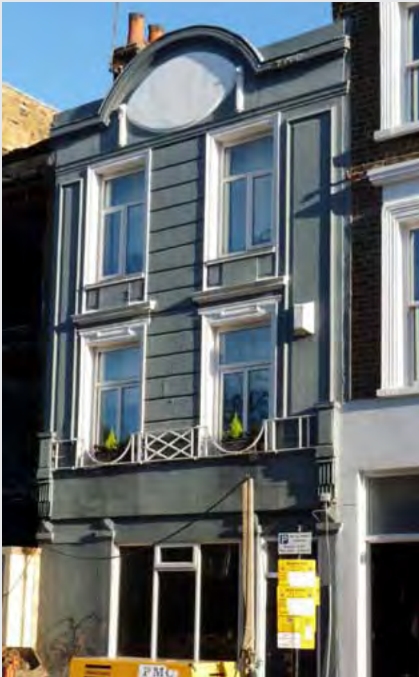
2.4.65 106 Princesdale Road has an interesting Art Deco façade, though it has been severely altered at ground floor level. It will now be protected by Art 4 direction, and suitable refurbishment of the ground floor façade should be encouraged.