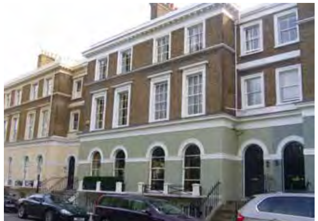
51-52 St James Gardens