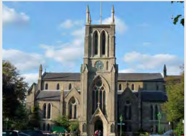
St. James's Church today

2.4.26 Article 4 Directions provide planning control over front facade alterations, and the paint colour of stucco decorations, in order to ensure that they provide worthy setting to their Grade II listed neighbours.