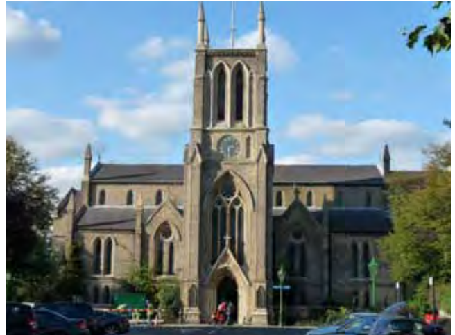
St James's Church

2.4.6 A combination of trees, the communal gardens (beautifully landscaped, particularly in Norland Square and Royal Crescent), and front garden planting, soften the lines of the terraces, providing shade and a sense of calm. But most private rear gardens are hidden from street view by the infilling of corner sites, unlike the villas of the Boltons, where private gardens and their planting feature in many views.