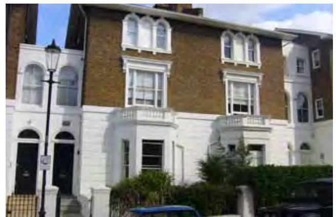
32 Portland Road