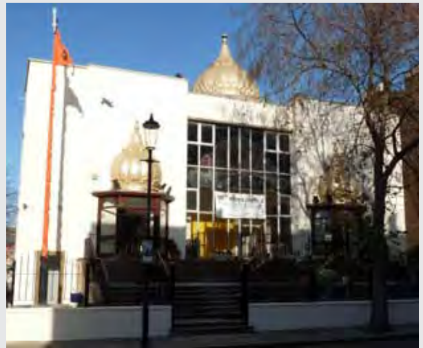
2.4.67 Another unexpected building is the Sikh Temple , The Central Gurdwara. In 1969, the Khalsa Jatha moved into this building, previously known as Norland Castle, at 62 Queensdale Road, after extensive re-building. The building consists of a Langar hall at basement level, the main divan hall on the ground floor and a 1st floor gallery. The gold domes were added to the exterior in the early 1990's and a new palki sahib was built. A further programme of refurbishment began in 2000 to extend the 1st floor gallery to provide a second hall for smaller divans.