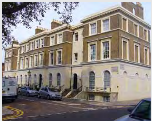
42-46 St James's Gardens