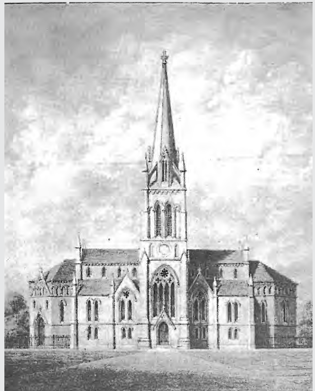
St. James's Church with intended spire