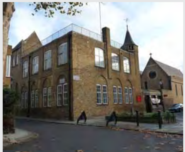
2.4.68 St Francis of Assisi Roman Catholic Church and The Presbytery , Pottery Lane, completes the multi-cultural assortment of religious buildings in the area. It was designed by Henry Clutton (1819-93), and the work was supervised (1859-60) by J.F.Bentley, the future architect of Westminster Cathedral. Both church and presbytery are listed Grade II.