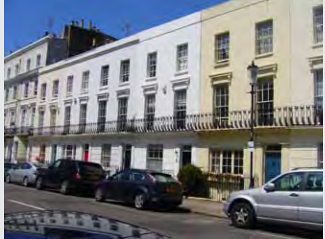
8-16 Norland Square

2.4.20 Even though of lesser architectural quality and not listed in their own right, the two terraces of Queensdale Road attached on both sides to the square's northern terrace contribute to the setting of the central listed terrace. First floor balconies and restrained stucco mouldings establish a measure of quality despite varied ground floor fenestration. For this reason the terraces justify protection from unsuitable elevational alterations. Article 4 Directions are in place controlling all details of the front elevations, windows and doors of these terraces, and paint colour.