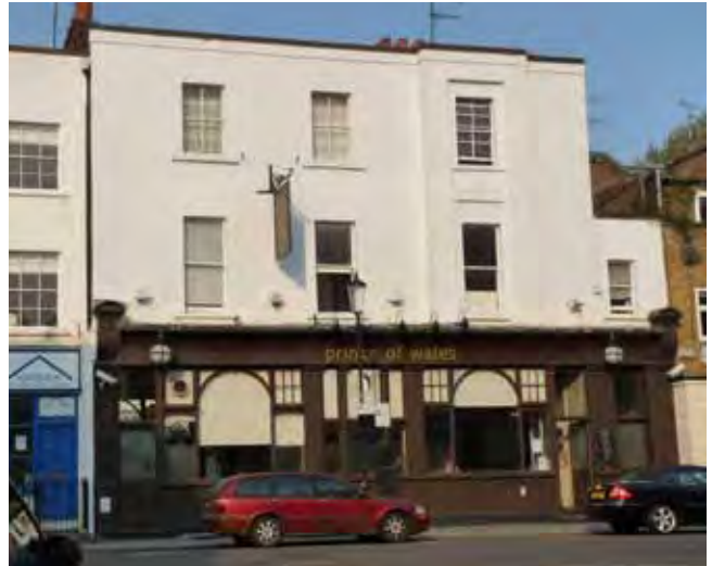
Former Prince of Wales public house

2.4.9 There are also many intriguing small differences between the houses within a terrace, indicating (as is known to be the case at the southern end of Addison Avenue) that different developers or craftsmen, were responsible for different pairs or part terraces of houses.