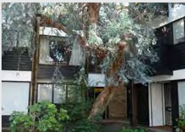
2.4.56 Princes Yard is an excellent example of imaginative modern design making the most of a tight corner.