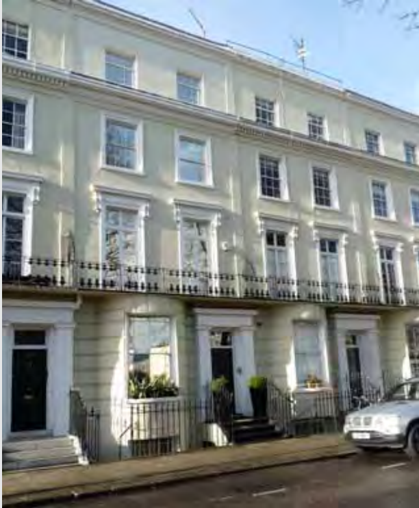
39-41 Norland Square

2.4.18 Norland Square, with its three long elegant terraces of stucco-fronted Italianate facades, featuring ornate console brackets supporting cornices over the 1st floor windows, main cornices above the 2nd floor and a plain cornice over the attic storey, is as much dependent on its communal garden for the pleasant ambience as on the buildings. The gentle rhythm of the attractive basement and ground floor segmental bays below the continuous first floor cast-iron ballustraded balcony makes the terraces reminiscent of 1830's and 1840's sea-side resort developments.