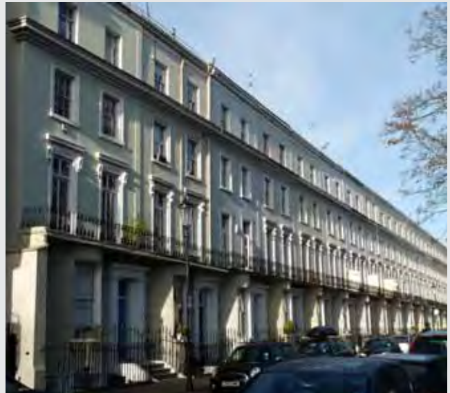
Norland Square terrace