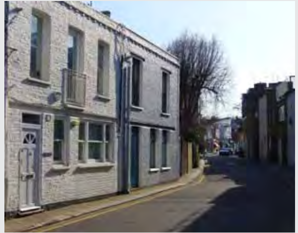
2.4.57 Pottery Lane has the distinction of being the only road predating the development of the estate: its sinuous alignment thus has nothing to do with fashionable taste at the time, but with original field boundaries. The original one- and two-storey brick buildings and high backyard walls, with their unaffected simplicity have been replaced in a multiplicity of styles, to make two-storey houses or offices in a variety of materials, on both sides of the road. Some of these are better suited to the character of the street than others.