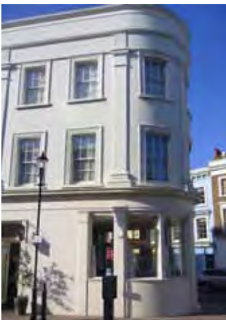
Cowshed, Portland Road