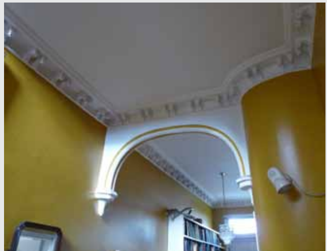
31 Addison Avenue - internal mouldings