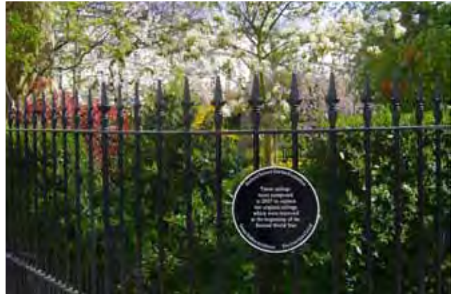
Railings, Norland Square