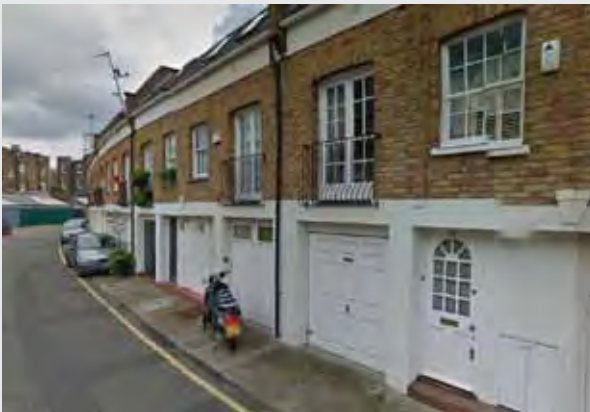
2.4.55 The run down ranges of garages that used to comprise Royal Crescent Mews have now been replaced by a terrace of bijou period style cottages: some of the decrepit garages remain at the north-east end. Further redevelopment in the same style would be advantageous.