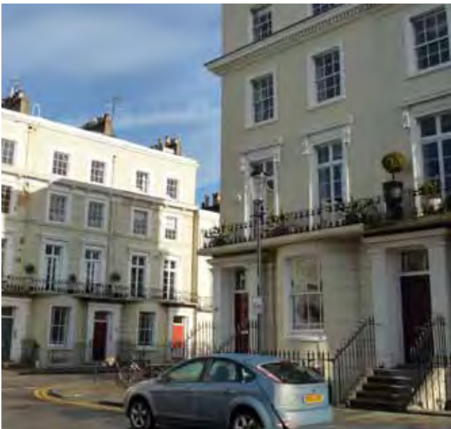
18, 19, 20 Norland Square