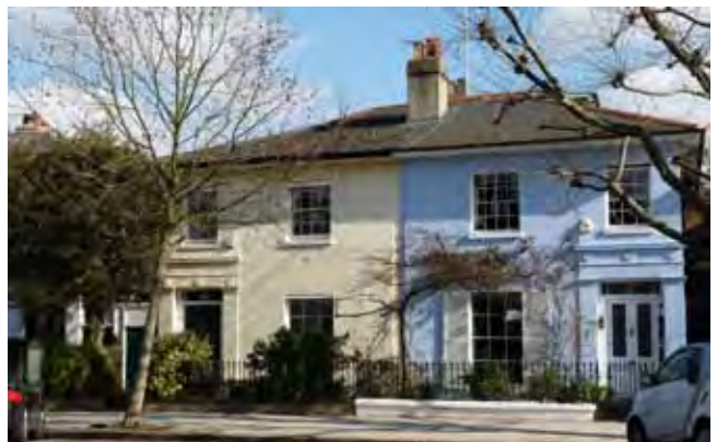
22-24 Addison Avenue