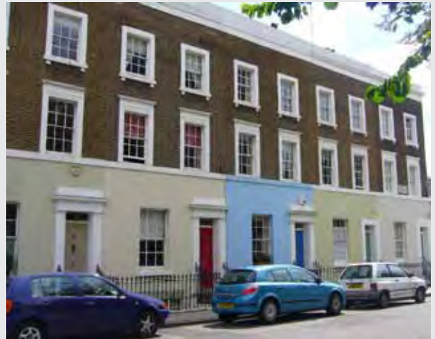
49-57 Queensdale Road

2.4.33 To the west of St Ann's Villas, the terrace on the south side continues the classical design, with plain stuccoed and painted elevations at ground floor and basement, and stock brick at 1st and 2nd floor, originally with a narrow cor-