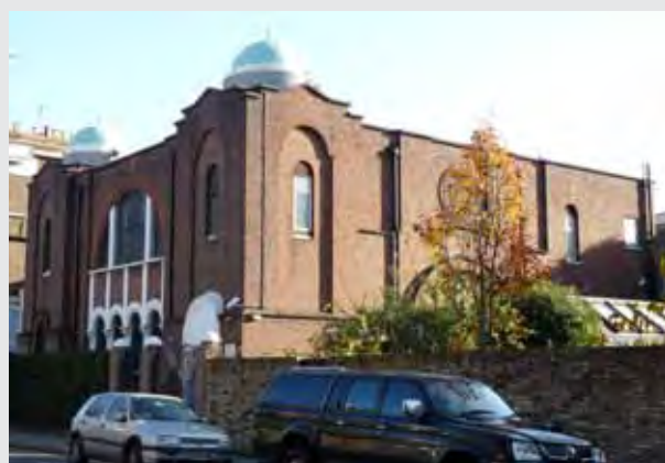
2.4.66 In the south-west corner of St James's Gardens, next door to No 8, is the Spanish & Portuguese Synagogue , built in 1928, in Byzantine style. This is an interesting building, built of dark multi-coloured stock bricks, with stucco dressings, (an "off-shoot" of the Bevis Marks synagogue in the City) and should be listed. Action will be taken by the Norland Conservation Society to this end.