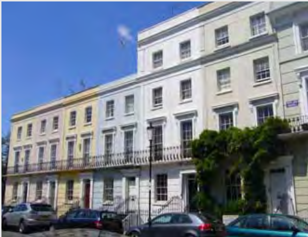
18-28 Queensdale Road

2.4.30 Queensdale Road intersects Addison Avenue, and runs across the top of Norland Square. Its lower numbers 2-14, and 16-28 are attached to either side of the northern terrace of Norland Square. Though of lesser architectural quality and not listed in their own right, these two terraces of Queensdale Road attached on both sides to the Square's northern terrace contribute to the setting of the central listed terrace. For this reason they justify protection from unsuitable elevational alterations. Article 4 Directions cover all details of the front façades, windows and doors of these terraces, and paint colour.