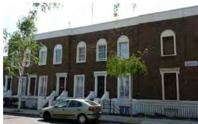
111-117 Wilsham Street

0.1.37 The boundaries of the conservation area have since been extended to include all the wedge of land between Norland and Ladbroke (mainly the north end of Portland Road), plus an area around Clarendon Cross, the shops fronting Holland Park Avenue to the south of the extended area and the Royal Crescent Mews and Norland Road area. These extended boundaries were adopted by the Council on 26 April 1978. The complete list was published in the London Gazette on 2 June 1978. On 25 June 1979 the Secretary of State of the then Department of Environment accepted that the extended Norland Conservation Area is of "outstanding historic and architectural interest".