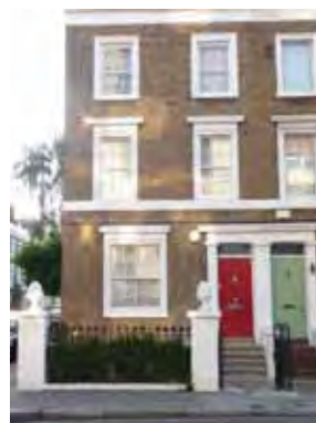
14 St. Ann's Road