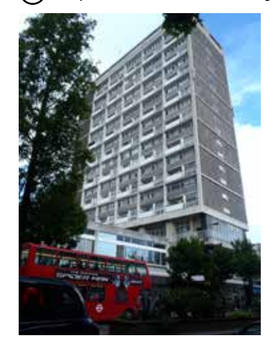
(10) Tesco, 118-120 Notting Hill Gate

(9) Campden Hill Towers, 108-112 Notting Hill Gate