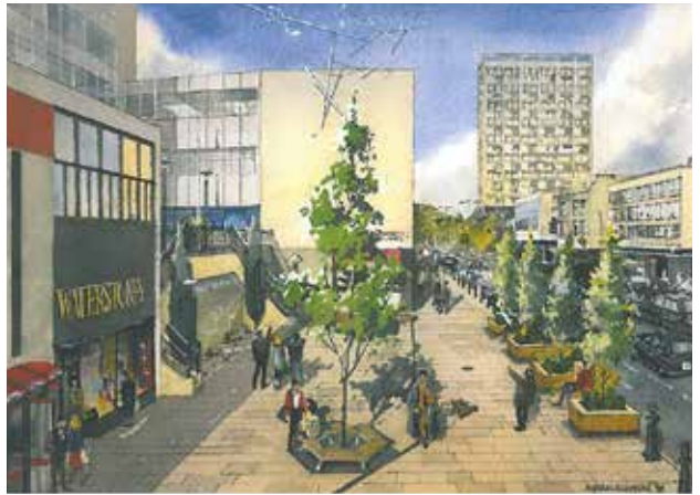
Postcard of Newcombe Piazza, 1998

The appraisal of these themes has led to the identification of key issues for each theme which any future policy, guidance, or development proposals will need to address. The assessment will be considered alongside other evidence studies to develop guidance as part of the SPD for Notting Hill Gate.