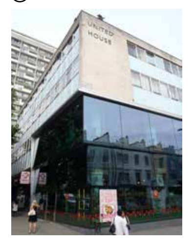
8 Tylers, 02 and Itsu, 100-106 Notting Hill Gate