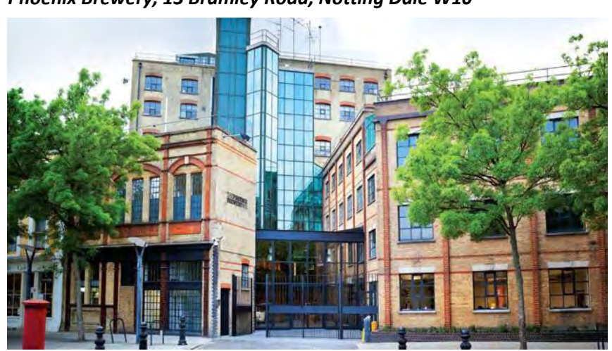
Phoenix Brewery, 13 Bramley Road, Notting Dale W10