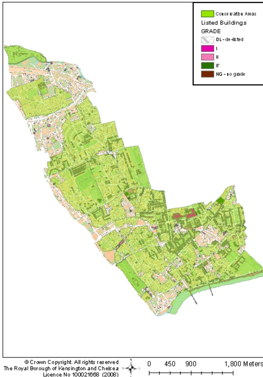
Figure 1: Conservation Areas and Listed Buildings

importance of the Thames and the functions it serves in addition to its importance for archaeology are recognized