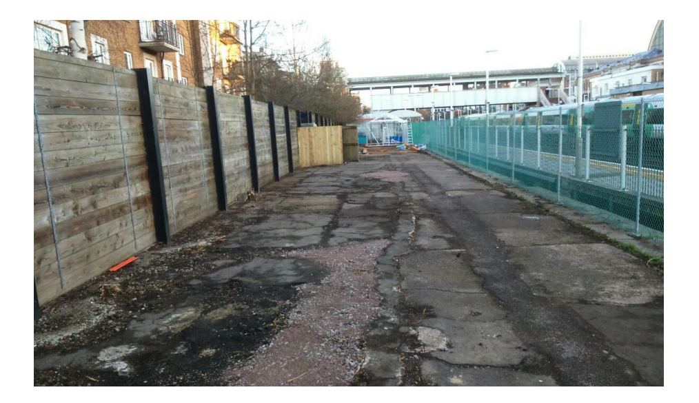
The cleared platform, ready for the new greenhouses