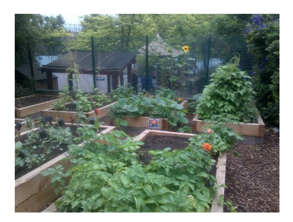
The new food growing garden at Barlby School