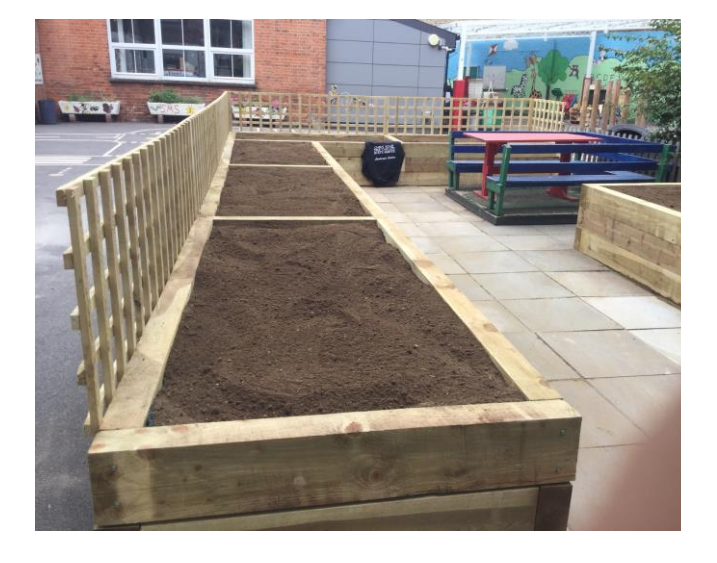
The new food growing garden at St Mary's school

The new food growing garden at St Charles Primary School