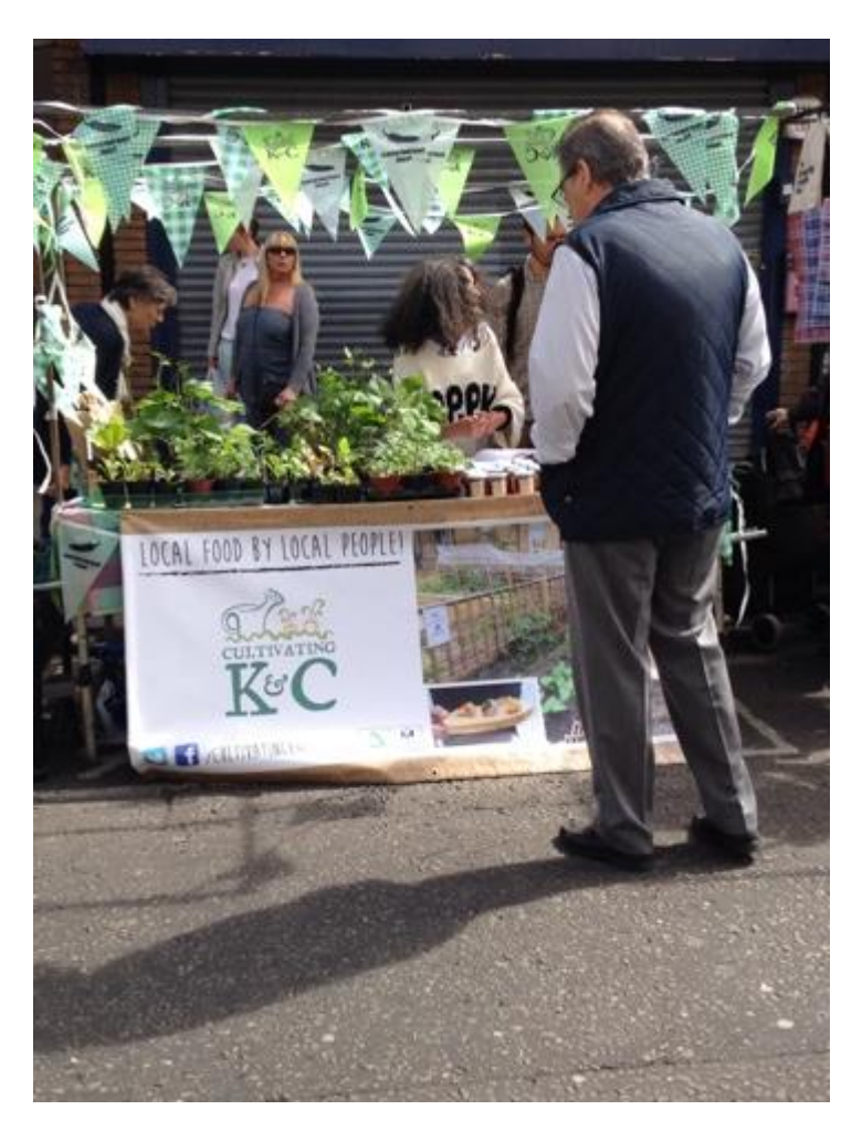
One of the "Test" Market stalls for Cultivating Kensington & Chelsea on Portobello Road