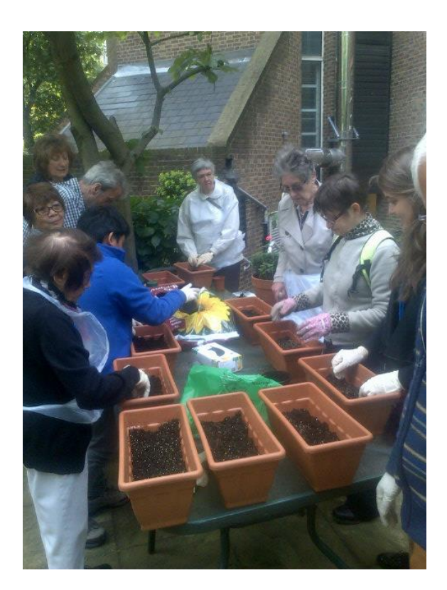
One of the planting workshops held at Inkerman House, a sheltered housing scheme in Earl's Court

A number of different community and environmental events were held throughout 2015/16, these included a number of planting workshops to promote the kitchen garden scheme, school planting sessions, and bulb planting events where over 3000 bulbs were planted by local residents and community groups, such as Scope and Age Concern.