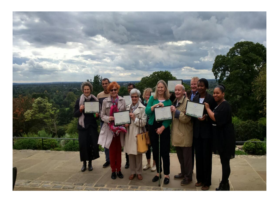
The successful "It's Your Neighbourhood" community group winners collecting their awards

The theme for London in Bloom 2016 is "Clean and Green for the Queen".