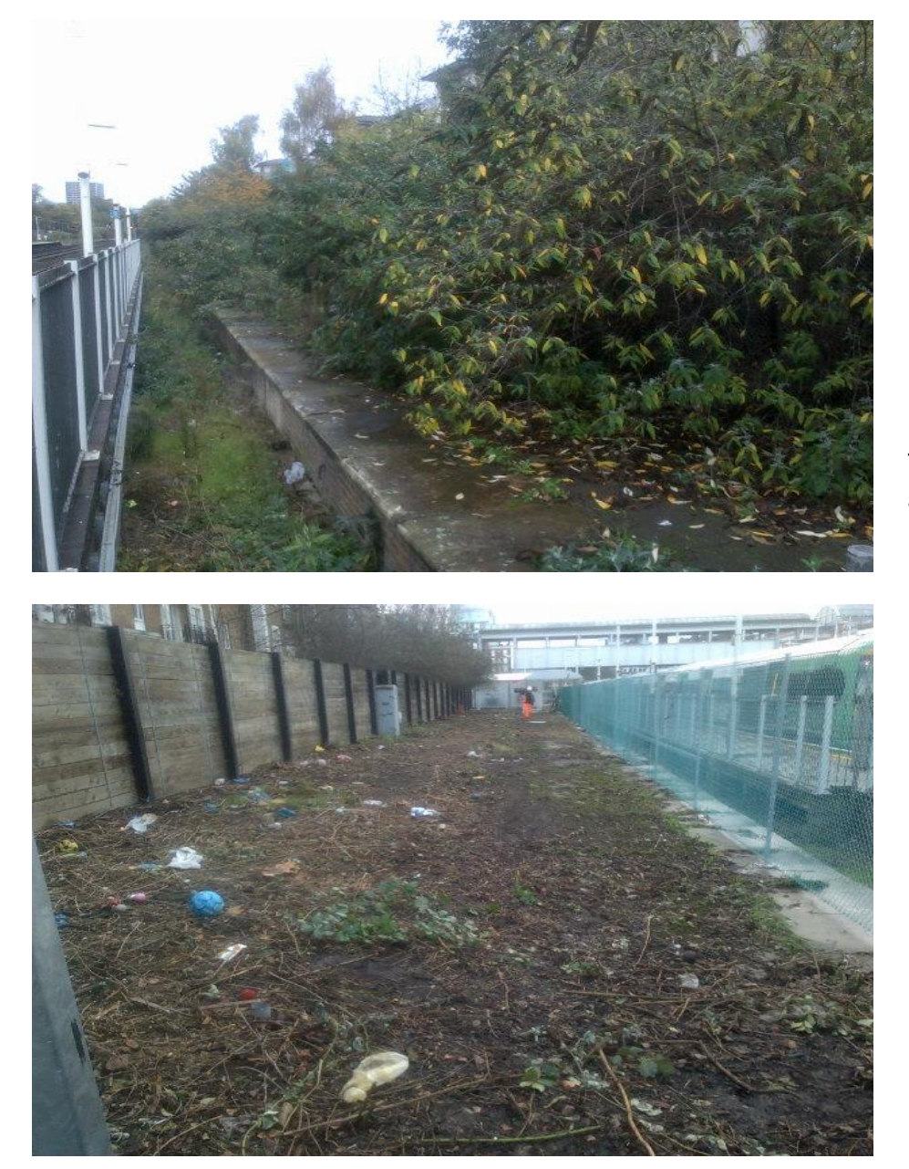
The overgrown platform at Kensington Olympia

access paths via Russell Road community kitchen garden installed. In Early 2016, the four large greenhouses were installed and are now fully operational.