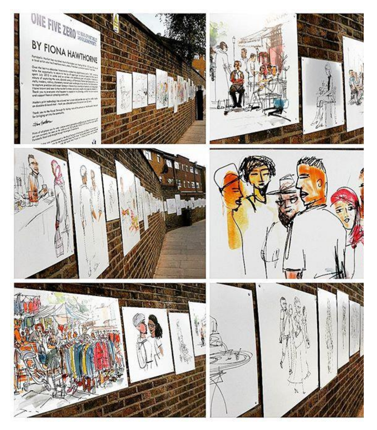
A sample of the new artwork on Portobello Wall

The RBEP also part funds the Portobello Wall Arts Project, which commissions new art work to be exhibited on the long stretch of wall at the northern section of Portobello Road. This year's artwork consists of sketches by artist Fiona Hawthorne.