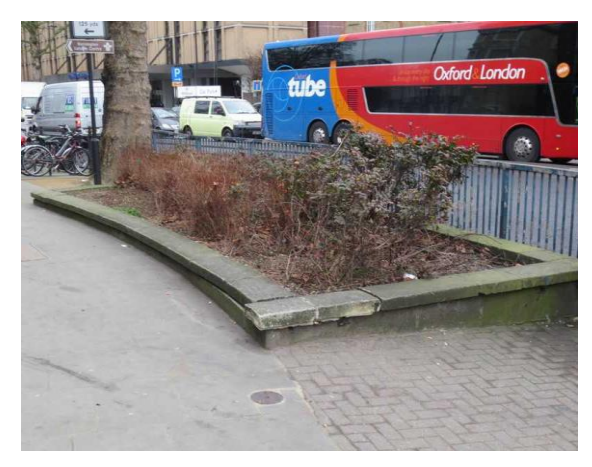
Holland Park Avenue planters -before