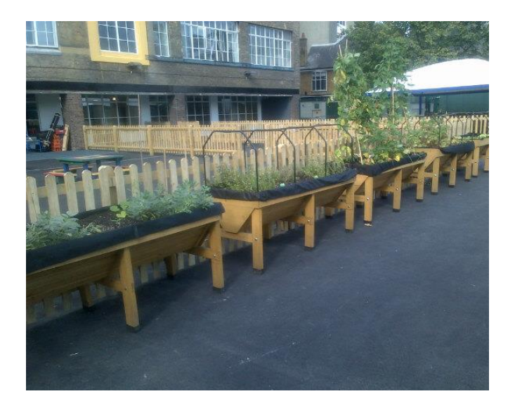
The moveable growing garden at Marlborough School, located at the new temporary school site