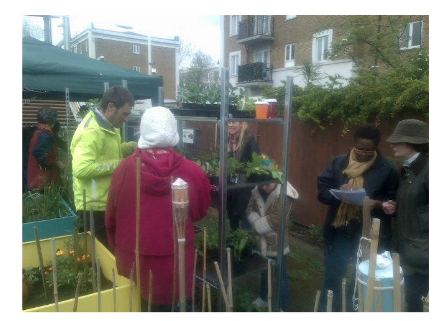
The first CKC plant sale held in April 2016 at Kensington Olympia. The seedlings proved very popular selling over £500 worth in 2 hours