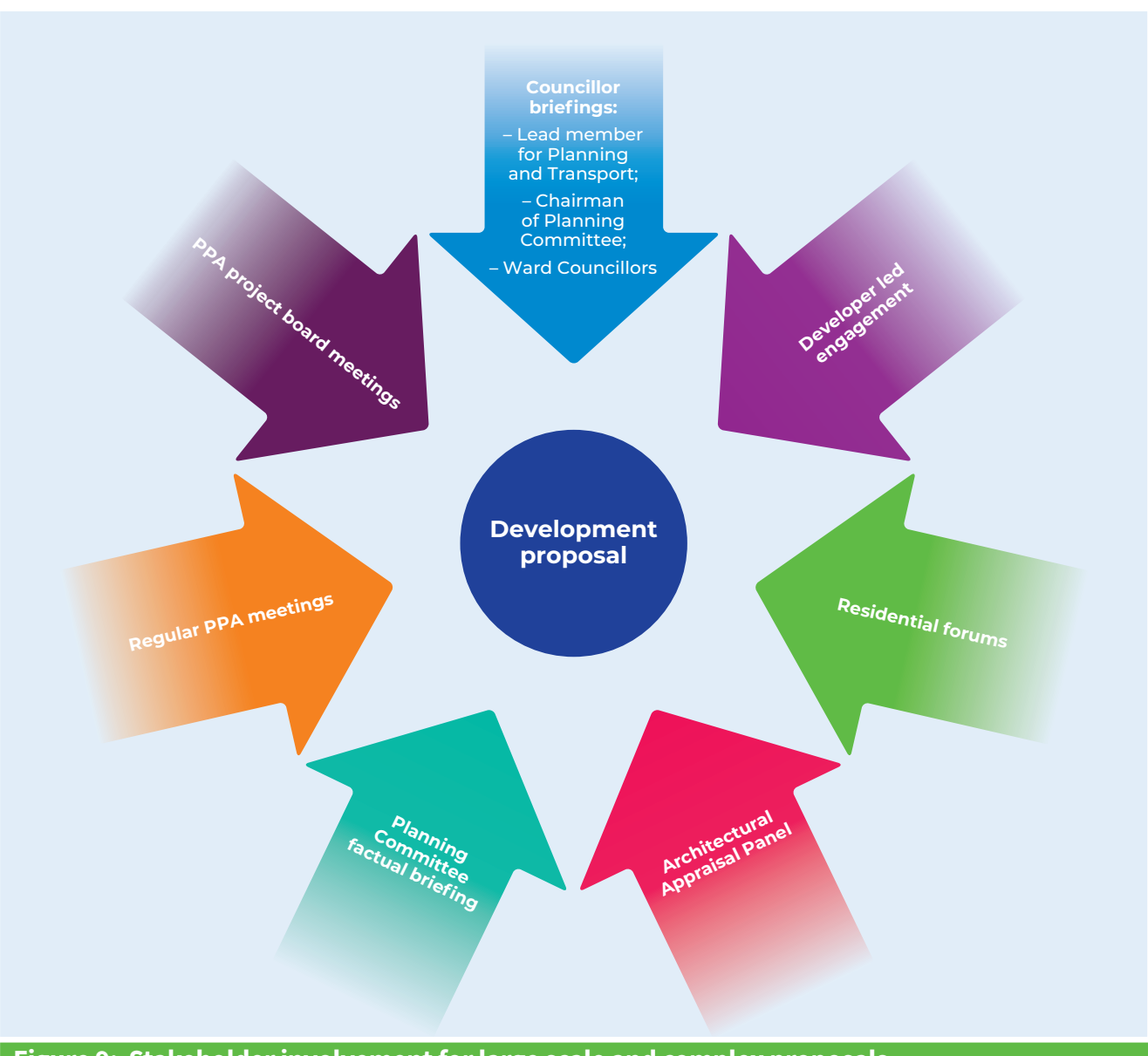
Figure 9: Stakeholder involvement for large scale and complex proposals