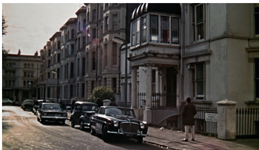
10592 - Powis Square Gardens