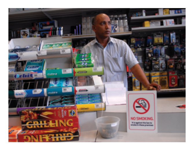
5.7 We will do this by:

reduced the proportion of people who start to smoke, especially children