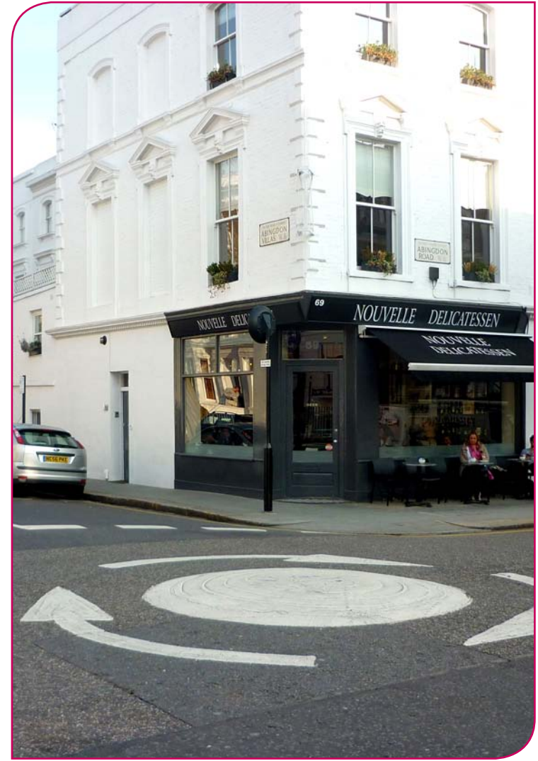
Mini-roundabout with white dome - Abingdon Road