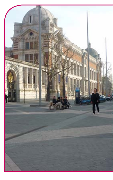
Exhibition Road - single surface

In Exhibition Road we created an inviting and accessible space based on the single surface concept with a corduroy strip providing delineation between areas designated for pedestrians only and areas where vehicles are permitted.