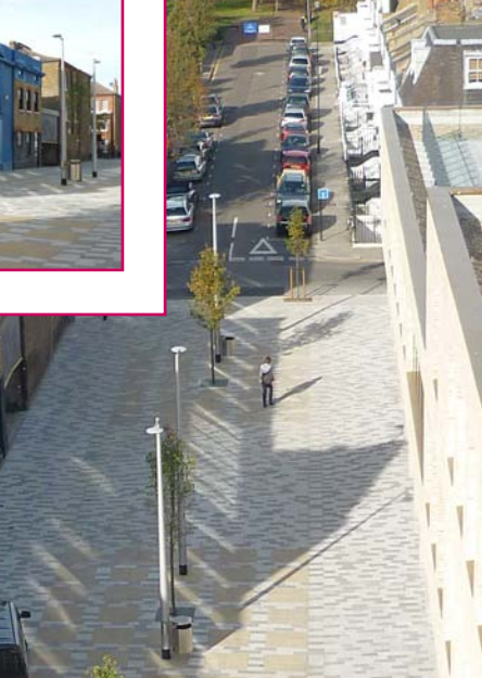
Single surface - Tetcott Road