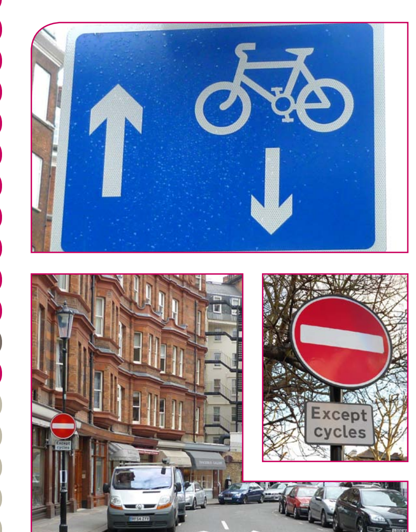
Signing for contra-flow cycling