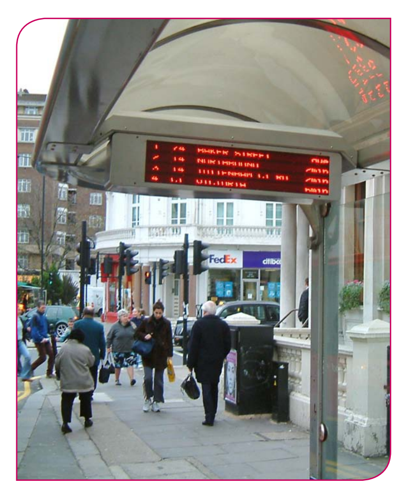
Bus shelter incorporating bus information board - Kensington High Street

The Council recognises the benefits provided by the information boards at bus stops telling passengers when the next bus is due.