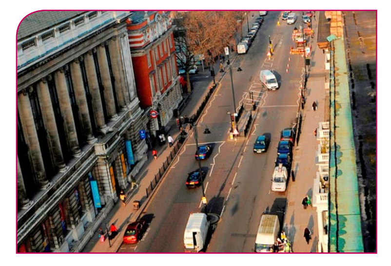
Exhibition Road - before