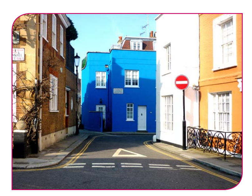
A single 'no entry' sign is sufficient