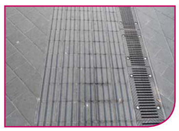
Corduroy delineator on Exhibition Road