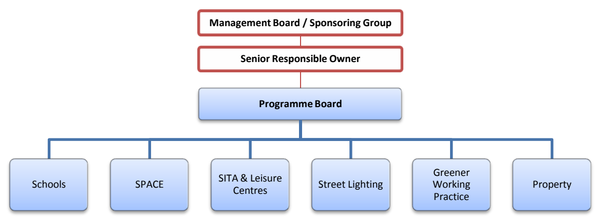
Figure one - Climate Change Governance