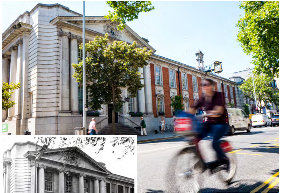
Chelsea Old Town Hall has been a London Landmark for generations. From bottom to top, you can see the Town Hall in the early 1900s, 1974 and 2018.

Nestled in the heart of London's iconic King's Road, this historic building has played host to many celebrity and high profile weddings throughout its rich past. From Judy Garland and Marc Bolan to Hugh Grant only last year, many well known personalities have said "I do" within its walls.