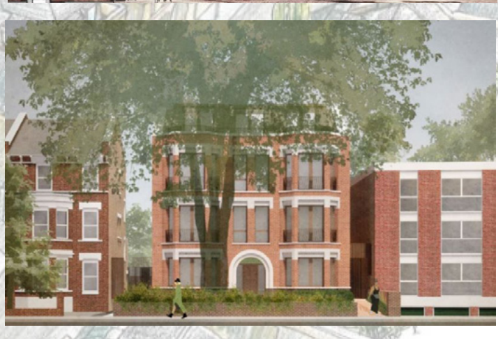
Pictured (clockwise from top left): Kensal Road; Acklam Road; St Helen's Gardens; and Hewer Street

View the plans by visiting www.rbkc.gov.uk and searching planning