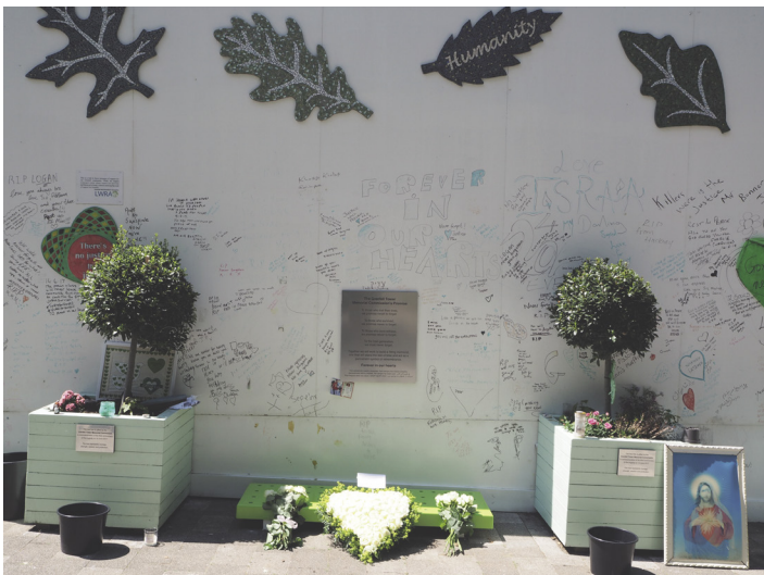
The Grenfell Tower Memorial Commission plaque and olive trees at the Grenfell Tower site.

In their commemorative video, the Memorial Commission's community representatives emphasise their wish to hear the hopes and ideas of as many bereaved families, survivors and residents as possible. This will make sure that the future memorial is developed by the community, for the community.