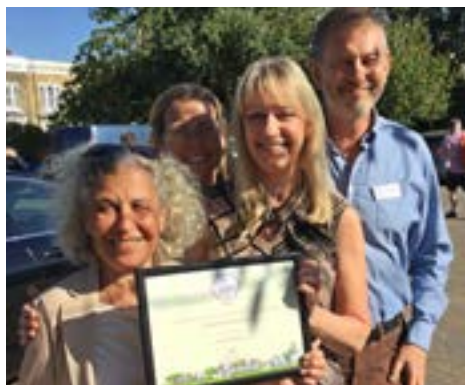
A group of gardeners with their award (above). One of the borough's many grow-gardens (below)