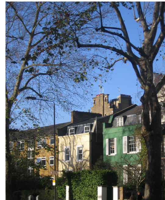
Holland Park

process. By offering advice to applicants during the pre-application process and by commenting on planning applications, the Quality Review Panel supports RBKC's planning officers and planning committee in securing high quality development. The panel provides a rigorous review process, encouraging high quality design in all areas of the borough and enhancing the Royal Borough of Kensington and Chelsea for all those who live, work, and visit.