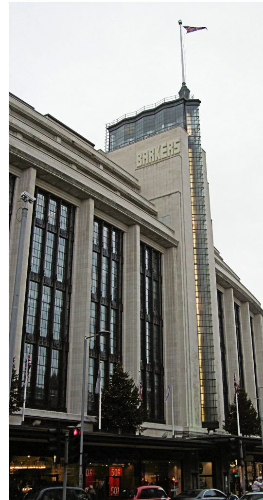
Former Barkers Department Store, Kensington High Street

https://www.london.gov.uk/sites/default/files/ggbd_london_quality_review_charter_web.pdf