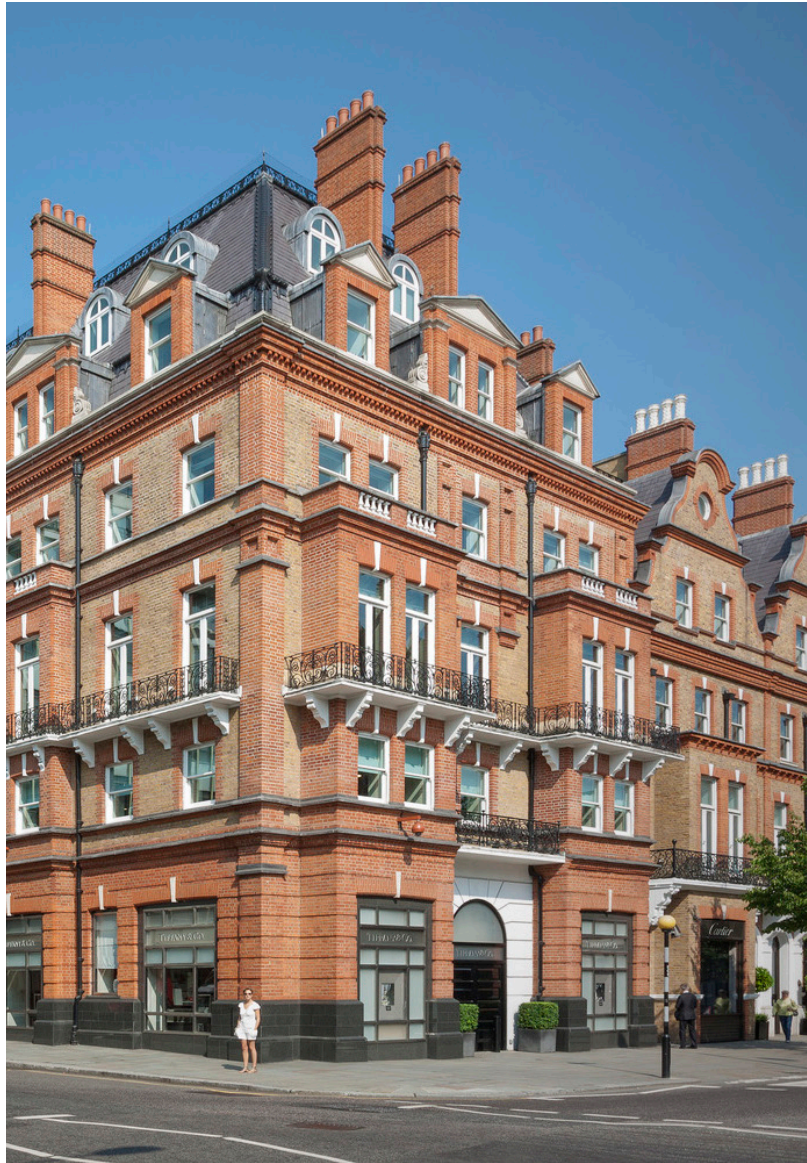
Mixed use building, Sloane Square, Chelsea © AKT II