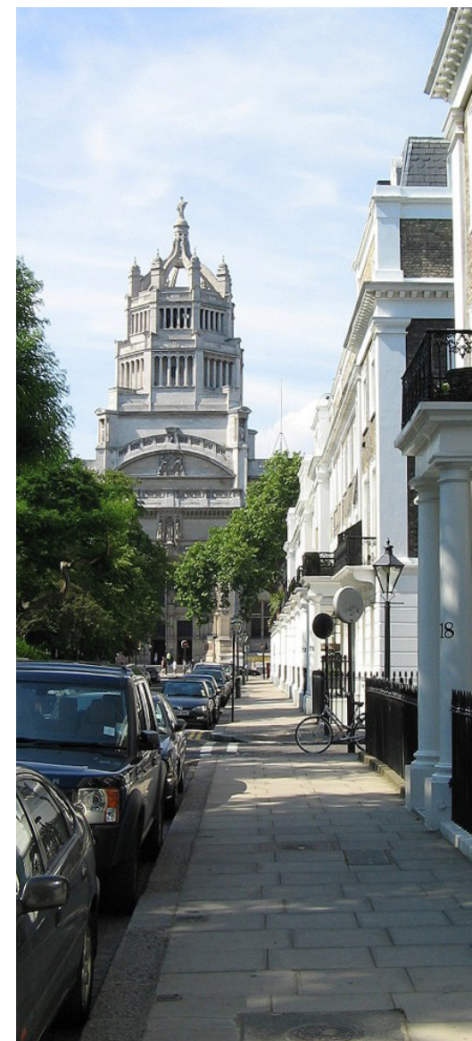
V & A from Thurloe Square

A surgery review will be summarised in a brief document no more than two sides of A4, rather than a full report.