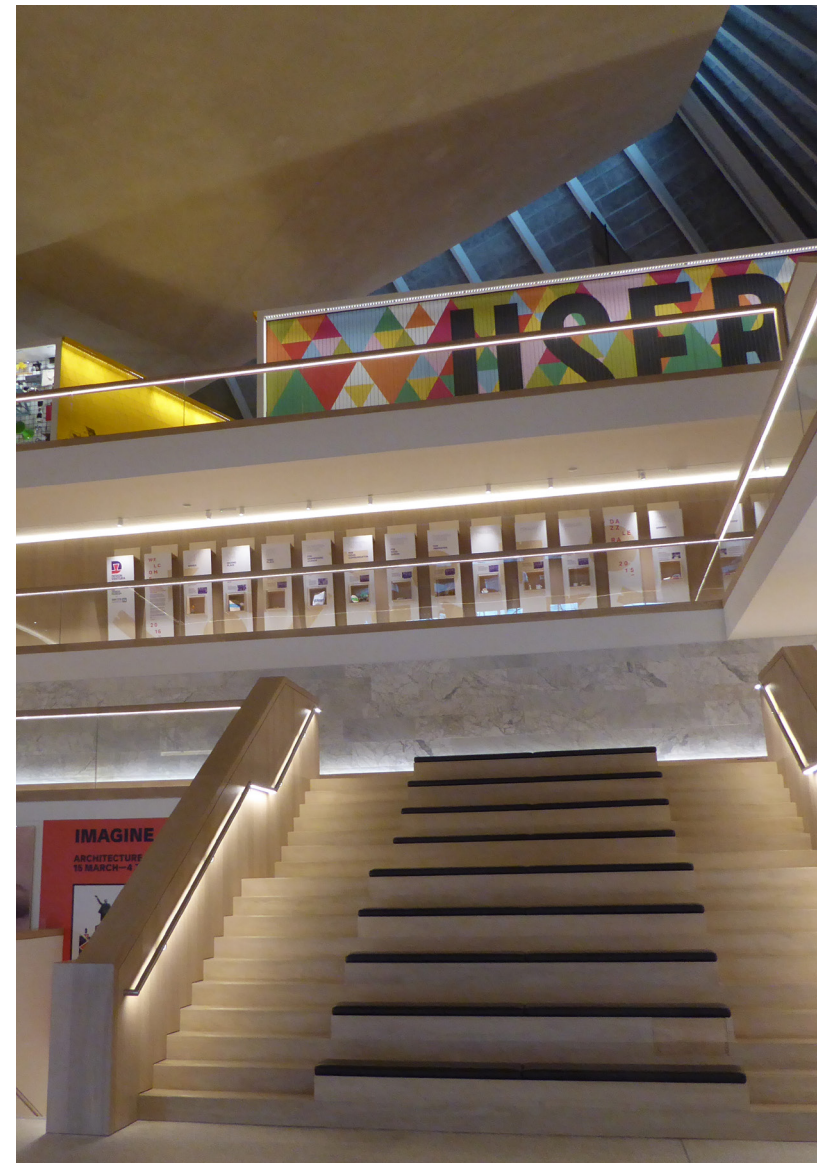
The Design Museum at the Grade II* Listed former Commonwealth Institute, by John Pawson

From time to time, it may be of benefit for specialist advice to be provided beyond the Quality Review Panel membership. In such cases, a professional with the relevant expertise may be invited to attend a review meeting, participating in the discussion with the status of an adviser to the panel.