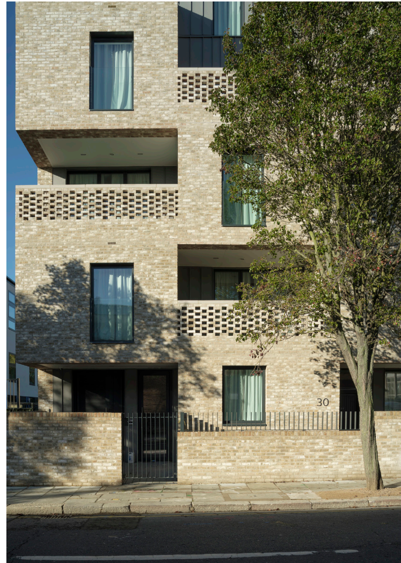
Middle Row Housing, by Penoyre & Prasad for RBKC Housing Design Awards 2013, 'Projects Award' Winner

Where a scheme returns for a second or subsequent review, the report of the previous review will be provided with the agenda.