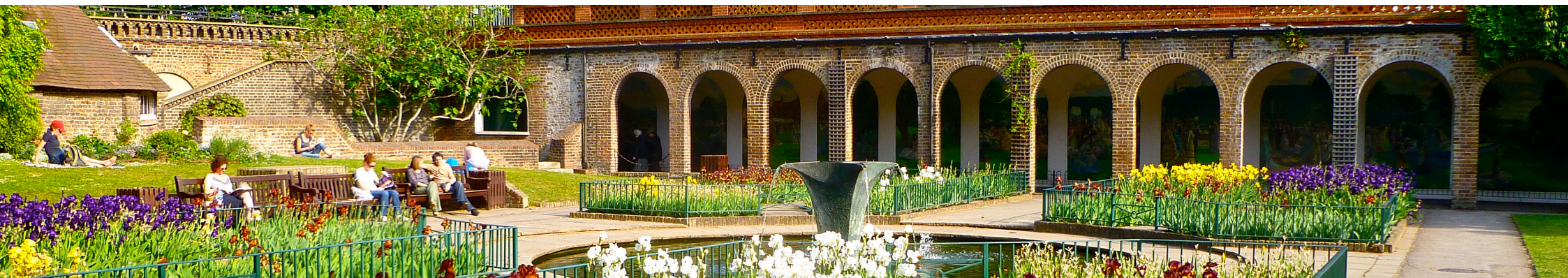
Holland Park

Design Review: Principles and Practice Design Council CABE / Landscape Institute / RTPi / RIBA (2013)