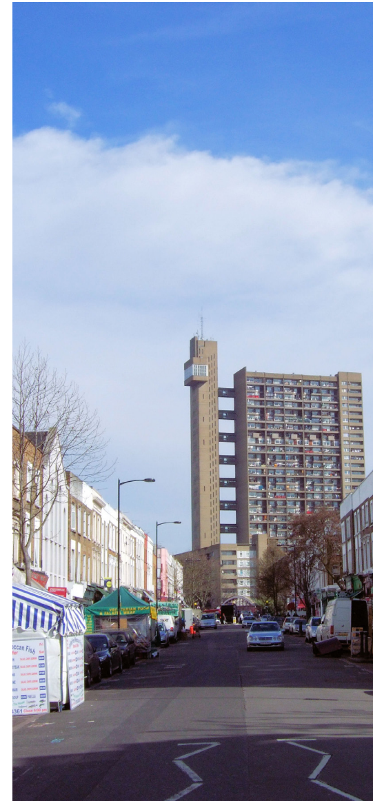
Trellick Tower from Golborne Road

At the end of each year, the Quality Review Panel manager will draft an annual report. This will be a brief document describing and reflecting on the panel's activities over the past year. As part of this annual review process, a meeting will be held with the planning authority and the panel chair to discuss the report and consider any recommendations for the following year.