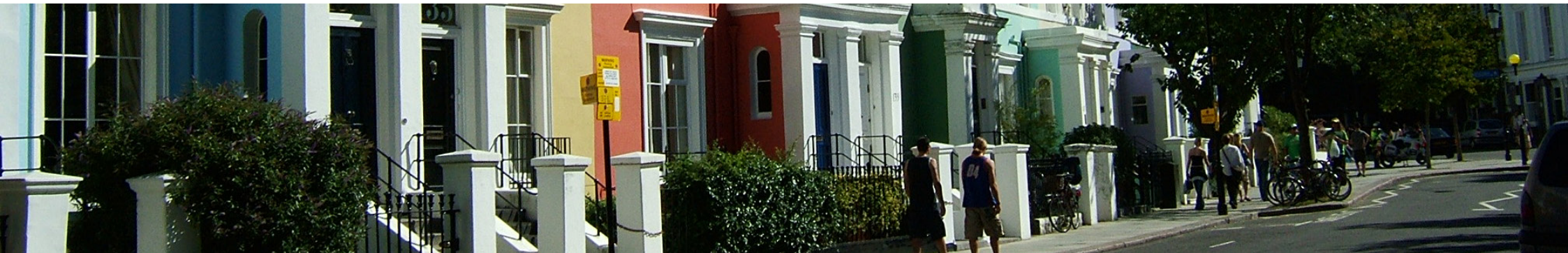
Notting Hill street

Large projects, for example schemes with several development plots, may be split into smaller elements for the purposes of review to ensure each component receives adequate time for discussion.