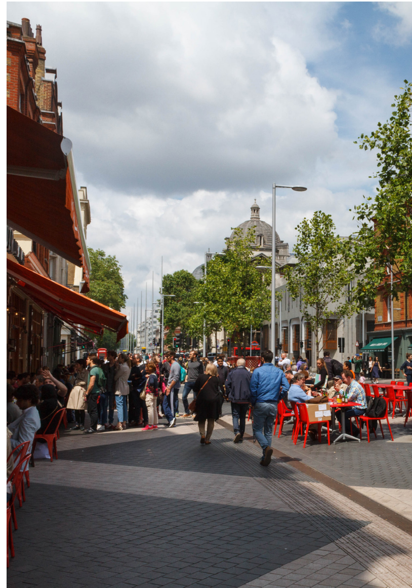
Exhibition Road looking north toward the Victoria & Albert Museum