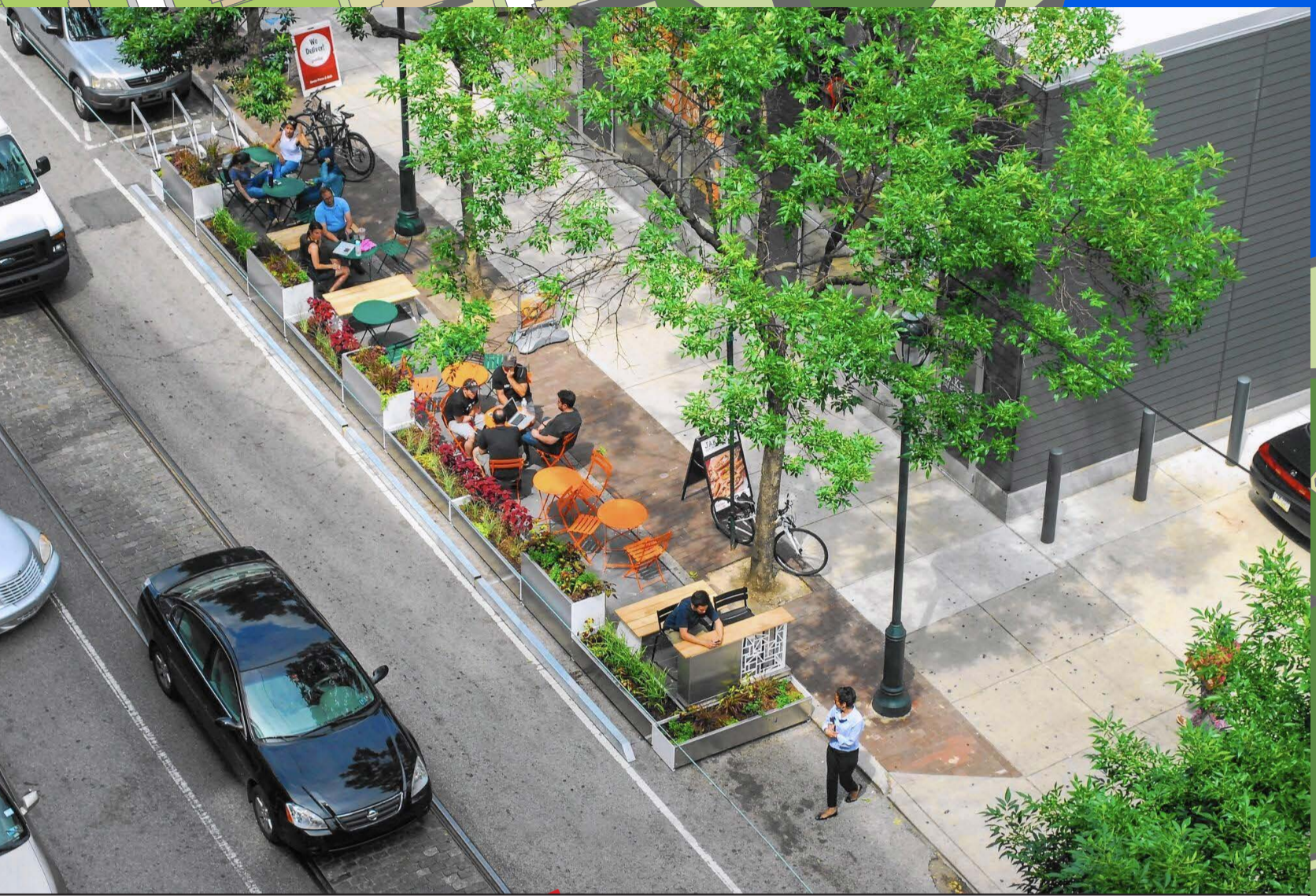
• Parklets normally take a parking space but we are proposing to put them on the pavement.