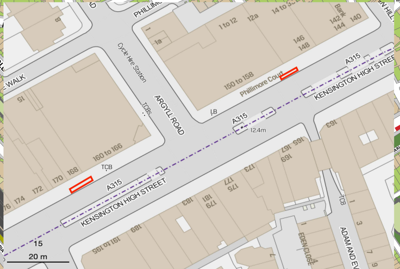
• Two potential locations on the northern, sunny side of the street where the pavements are wide.