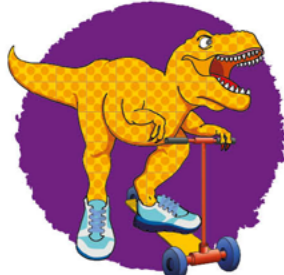
Speedy, scooting Tyrannosaurus Steps