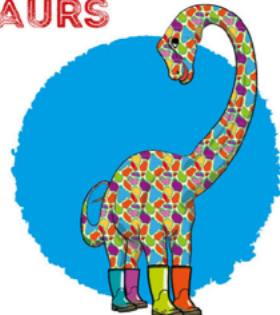
Slow and steady Peditlodocus