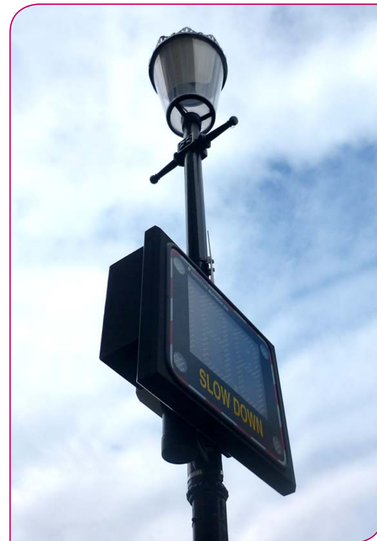
Speed indicator sign

Wherever possible we erect these signs on existing lamp columns although their weight precludes their use on certain types of column.