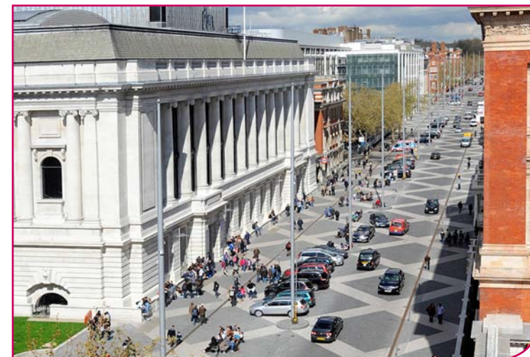
Exhibition Road – after