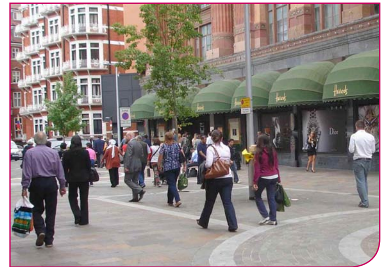
Single surface in Hans Crescent