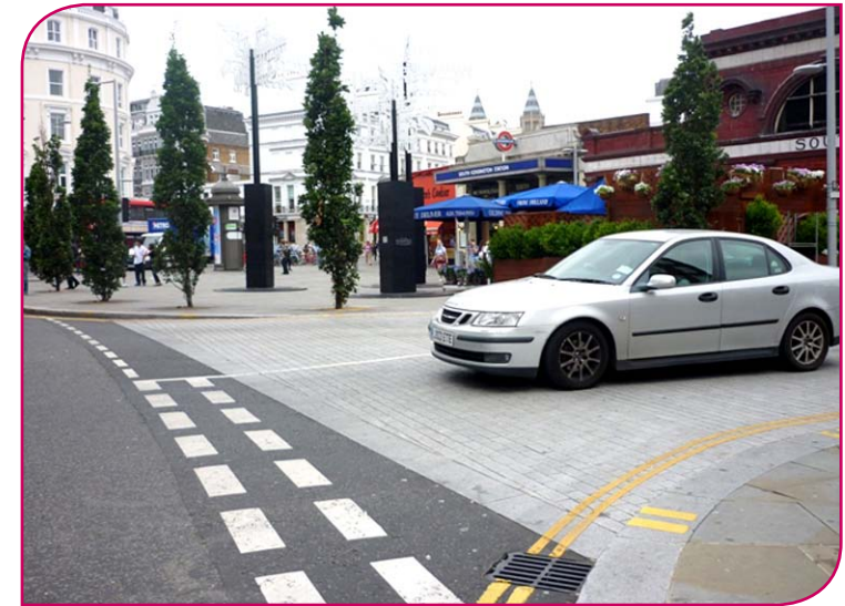
Entry treatment in Pelham Street

At junctions where traffic speeds are a problem, raised tables and entry treatments can help to improve safety by reducing traffic speeds. We therefore consider constructing these at junctions where there is a recognised speed related road safety problem. These can be expensive and we will use asphalt surfacing in most cases to minimise construction time and costs.