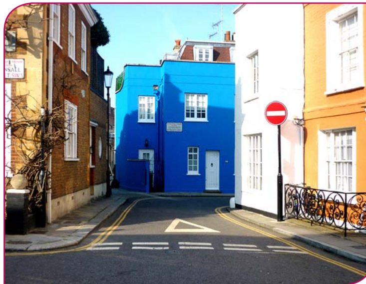
A single 'no entry' sign is sufficient