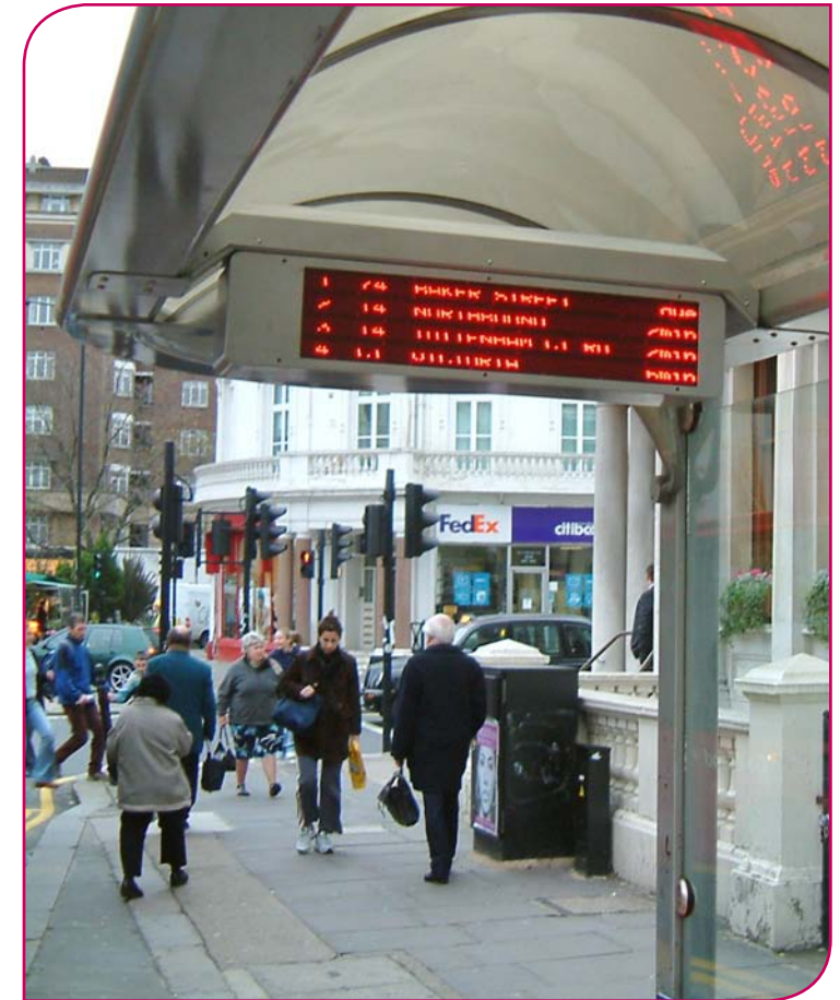
Bus shelter incorporating bus information board – Kensington High Street

The Council recognises the benefits provided by the information boards at bus stops telling passengers when the next bus is due.