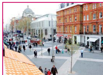
Corduroy delineator on Exhibition Road