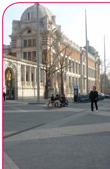
Exhibition Road – single surface