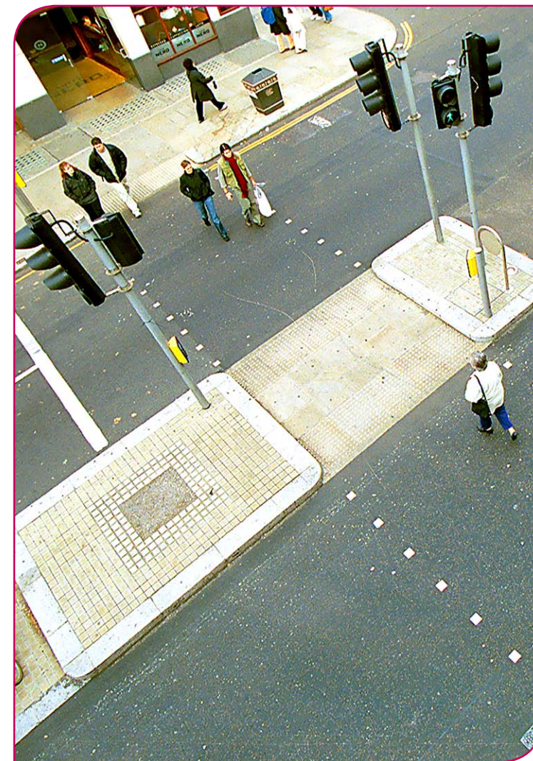
Straight-across crossing – Kensington High Street

Where pedestrian refuges are installed to help pedestrians to cross the road a central refuge beacon is rarely needed and will only be installed if there is a recognised problem of drivers failing to notice the refuge and this cannot be rectified by improved lighting or other means of improving visibility.