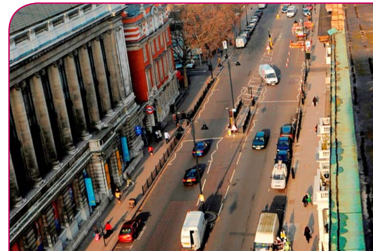
Exhibition Road – before

In Exhibition Road we created an inviting and accessible space based on the single surface concept with a corduroy strip providing delineation between areas designated for pedestrians only and areas where vehicles are permitted.