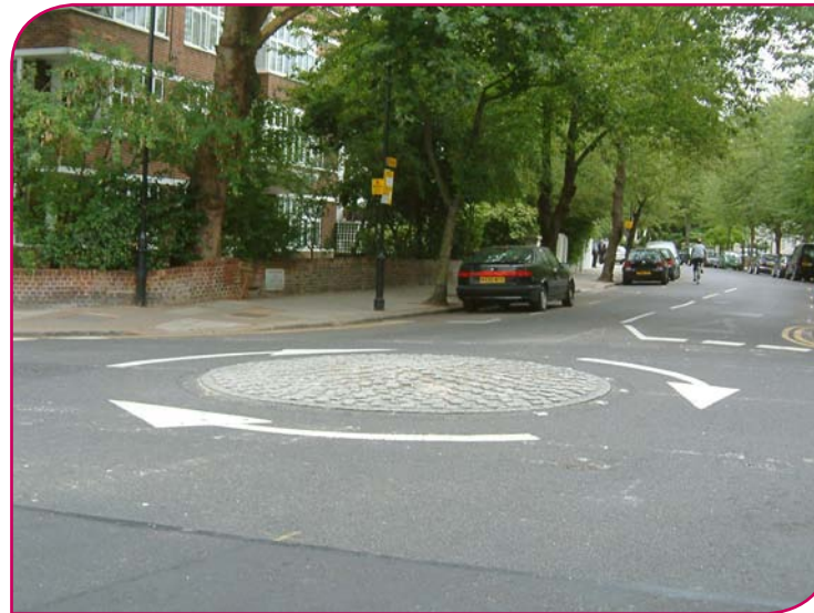
Mini-roundabout with granite setts – Chepstow Villas

At other locations, for example in areas where white stucco buildings are the predominant architecture, the standard white dome blends in well with the immediate surroundings and is our preferred design.