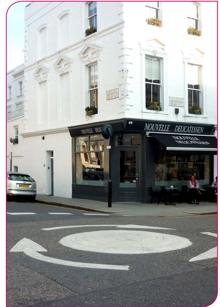
Mini-roundabout with white dome – Abingdon Road