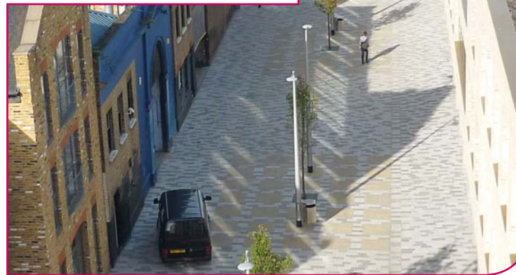
Single surface - Tetcott Road