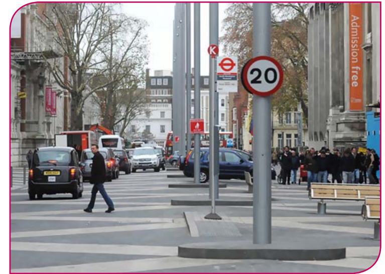
20 mph limit in Exhibition Road

The key issue is one of enforceability. Without the use of expensive and unpopular measures enforcement would rely upon a heavy and unrealistic commitment from the police. We will therefore only consider introducing 20 mph zones or speed limits in exceptional circumstances, where there is a clear history of speed-related collisions involving personal injury.