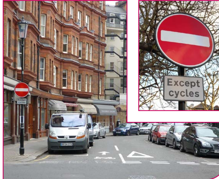
Signing for contra-flow cycling