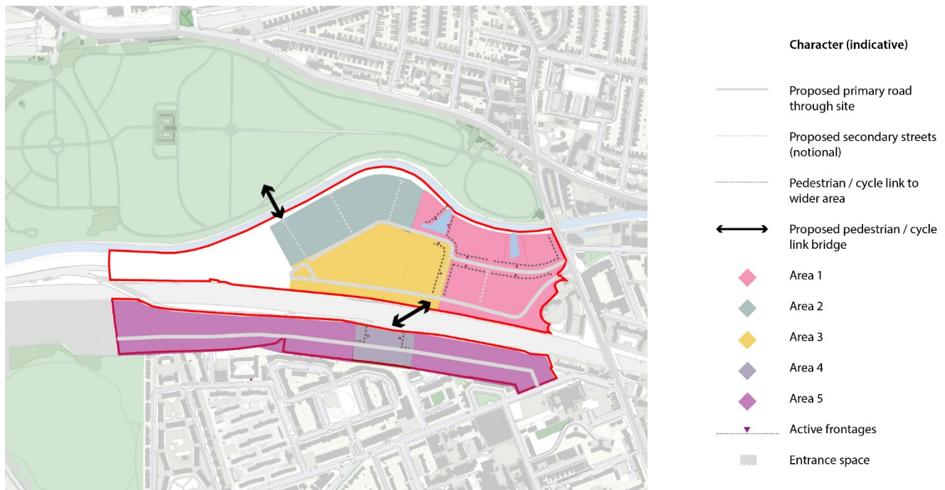
Figure 2: Character Areas