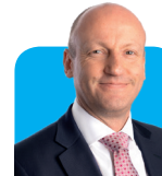
Stuart Love Chief Executive Westminster City Council